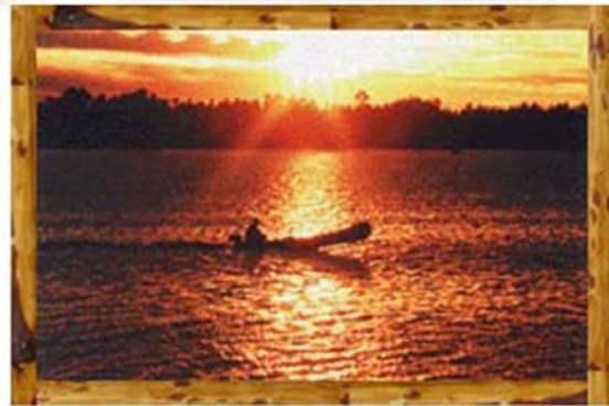
Minnesota Office of Tourism